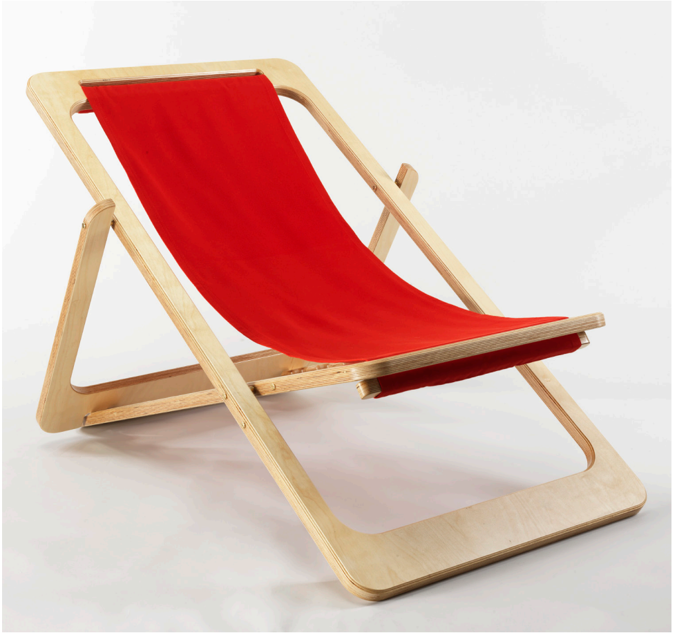
THE FLATJACK CHAIR